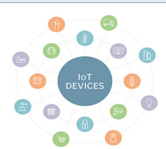
Figure 2. Internet of Things (IoT) Devices

Internet of things (IoT) is a new expertise which adds many utilities to connect the things and human beings through the internet. Internet of things can afford some elegant attractive applications in making healthcare, transportation, insurance and agriculture work more efficiently. However, various factors like security, privacy and data storage also need to be considered. Though Internet of Things can improve the product, but