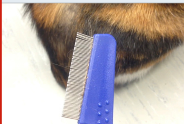
Figure 1: Collection of fleas and eggs during combing