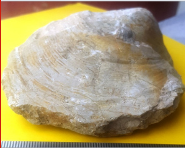
Figure 5: Inoceramus concentricus Parkinson var. baghensis

Description: The shell has thin test and is of medium size. Its shape is ovate and inequilateral. Antero-posteriorly and dorso-ventrally the left valve is inflated and is convex. Postero-dorsal is broadly arched, ventral margin is narrowly curved, posterior broadly arched and postero-dorsal margin is almost straight, while the antero-dorsal margin area is slender and straight, antero-ventral is smooth and rounded. The surface is deliberated and adorned with a vast number of closely placed concentric rings and low broad concentric ridge. The ridges are still stronger, raised to a large extent, and set apart by narrow deep depressions ventrally.