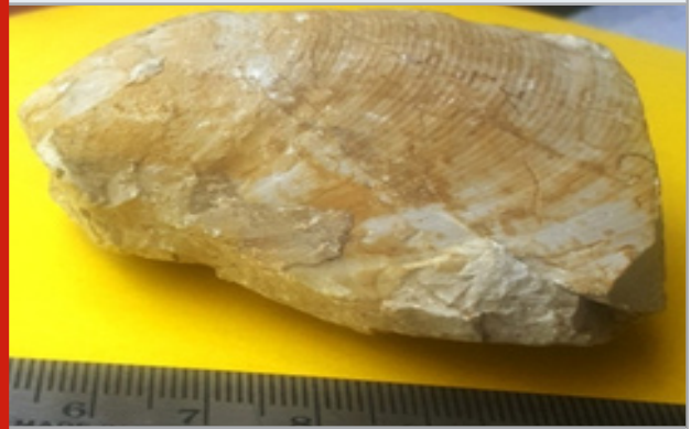
Figure 6: Inoceramus concentricus Parkinson var. subsulcatus Willshire

Description: Its shell is elevated, thick and moderately tumid. Umbones are slightly incurved distinctly pointed and antero dorsal area is flat, straight and long while antero ventral region is rounded. The postero dorsal area is compressed and flattened. The surface ornamentation consists of weakly developed fine concentric lines which are becoming finer posteriorly. Two superficial ribs are also noticeable.