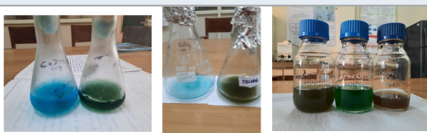
Figure 1: Visual confirmation of Bimetallic Cu-Zn nanoparticles from leaf extracts of Terminalia (a) , Tecoma (b) and c) Solanum

The visible color change of blue copper sulfate was used to confirm the presence of bimetallic Cu-Zn nanoparticles and colorless zinc nitrate solution to greenish colored solution on reduction using plant leaf extracts and as plant part