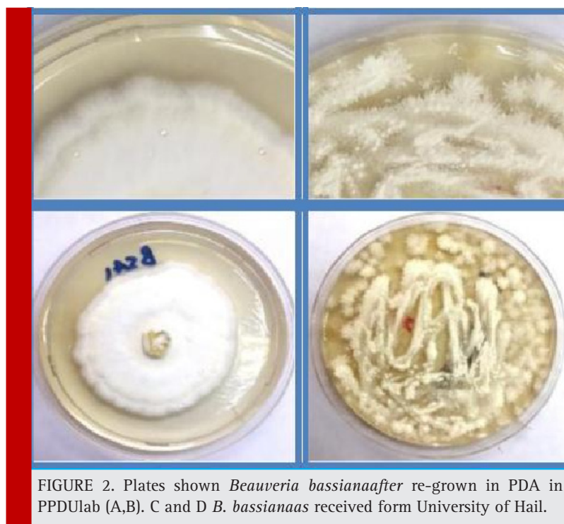
FIGURE 2. Plates shown Beauveria bassiana after re-grown in PDA in PPDULab (A,B). C and D B. bassiana received from University of Hail.

amplify the entire ITS region (White et al. , 1990). PCR was done in a 25 µl reaction containing 1 µl of the fungal DNA extract (40 ng of total DNA), 2 mM MgCl 2 , 2.5 of 10x PCR buffer, 1.5 µL of 10 µM of each primer, 2.5 µl of 10 mM dNTPs, 0.3 µl of 5U Taq DNA Polymerase and the reaction was completed to 25L with Nuclease-free water. PCR was conducted in the ESCO Swift Maxi Thermal Cycler with initial denaturation at 95°C for 2 min, followed by 35 cycles of 95°C for 30 sec, 52°C for 30 sec, and 72°C for 30 sec, and the final cycle is a polymerization cycle performed at 72°C for 10 min. PCR Products were purified using QIAquick® PCR Purification Kit (Cat. No. 28106) according to manufacturing procedures.