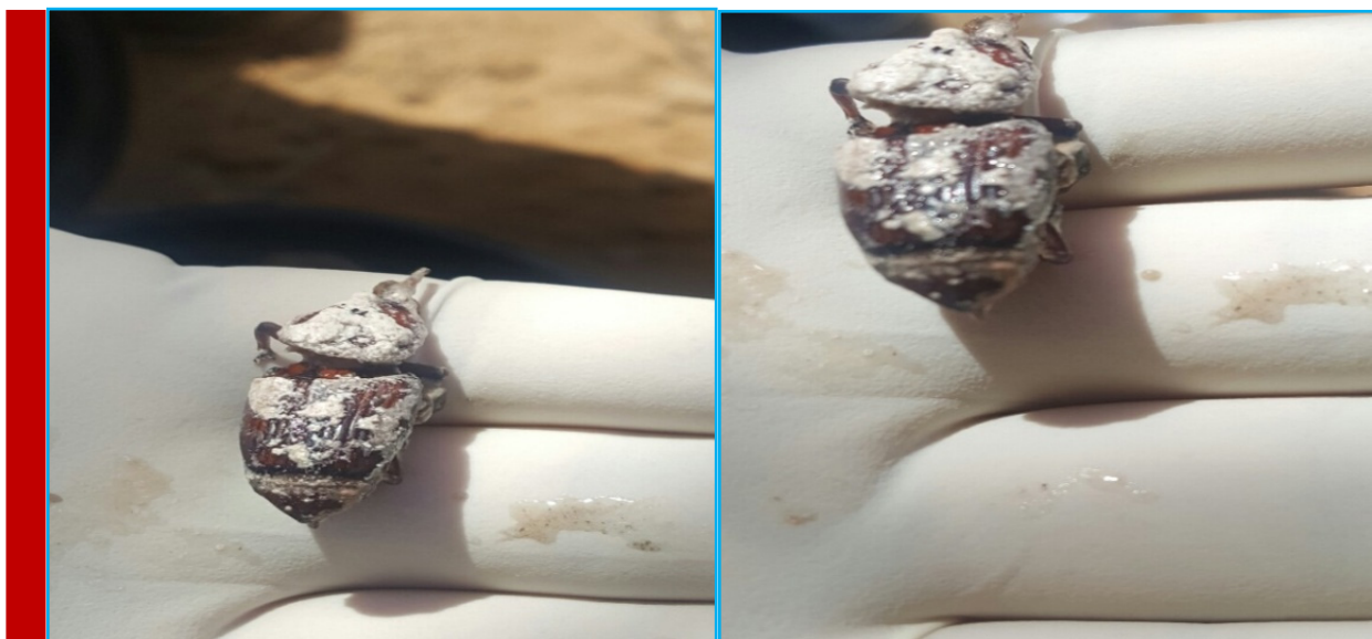
FIGURE 1. Fungal growth of red palm weevil in Hail region.

Parts of fungal propagules grown on the cadavers were then transferred, with sterile needles, into Petri dishes with SDAY1/4 (Sabouraud Dextrose Agar Fluka supplemented with yeast extract \frac{1}{4} of concentration) and kept in an incubator at 25°C. Pure fungal colonies were then stored on PDA (Potato Dextrose Agar) and MEA (Malt Extract Agar) slants in bacteriological glass tubes at 4°C. The B. bassiana isolates were confirmed by sequencing analyses of the 18S rRNA gene and the internal transcribed spacer (ITS1).