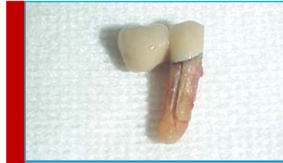
FIGURE 2. Root fracture

In RCT studies, cast posts in all aspects of treatment failure (loss of stuck, post fracture, root fracture, endo-