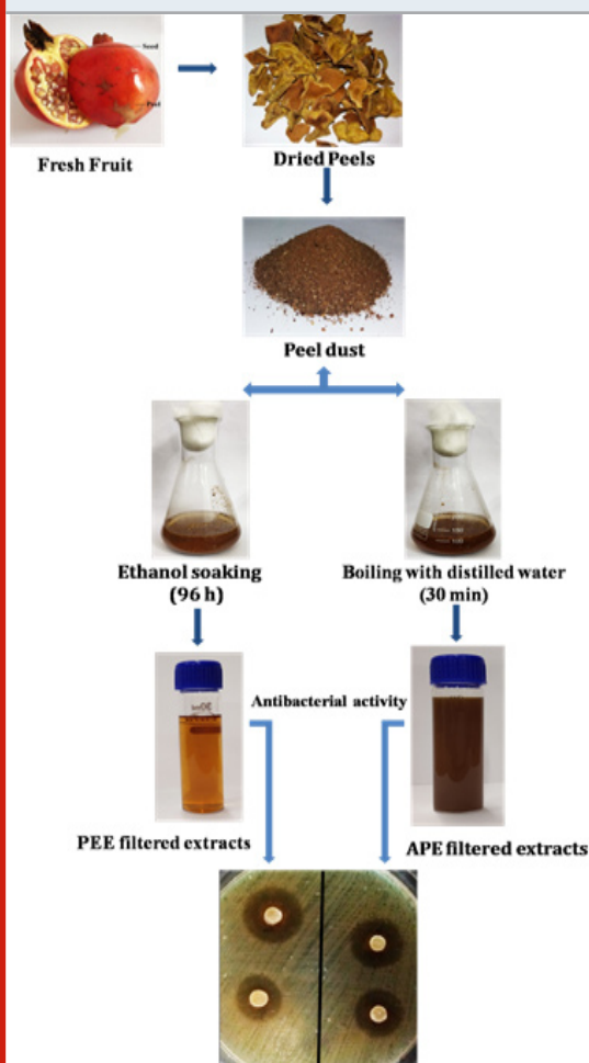
Figure 1. Flow diagram for antibacterial activity analysis of pomegranate fruit peel ethanolic and aqueous extracts

The abbreviation of the plant extracts are mentioned in the text”: