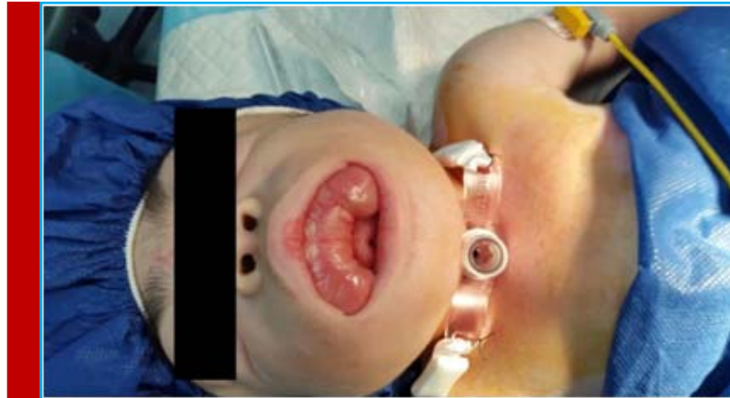
FIGURE 3. Tracheostomy was carried out to provide a secured air way.

elective tracheostomy was performed was done under general anesthesia (Figure 4). Skin stiffness, rigidity of trachea and narrowing of air passage during procedure were considerable. Short neck and small stature made the procedure more difficult. Gingivectomy was done in a large scale for each quadrant (Figure 5, 6).