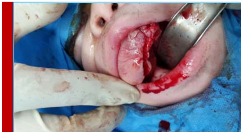
FIGURE 4. Soft tissue removal for 1 quadrant of upper jaw.

The MPS type VI is an inborn metabolic and autosomal recessive disease caused by mutations in the arylsulfatase B gene (Alpoz et al. 2006). A mutation in chromosome 5 is responsible to this syndrome (Baehner et al. 2005). This enzyme is called N-acetyl galactosamine 4-sulfatase which plays an important role in metabolism of GAG (Malm et al. 2007). This gene is required for the degradation of dermatan sulfate and deficiency leads to cumulation of undegraded or partially degraded