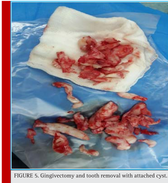
FIGURE 5. Gingivectomy and tooth removal with attached cyst.

mucopolysaccharides which results in large lips and thick gingival tissue and corneal opacities (Alpoz et al. 2006). It is reported the frequency of the MPS type VI ranges from 1:100 000 births to 1:1300 000 in various populations (Meikle et al. 1999).