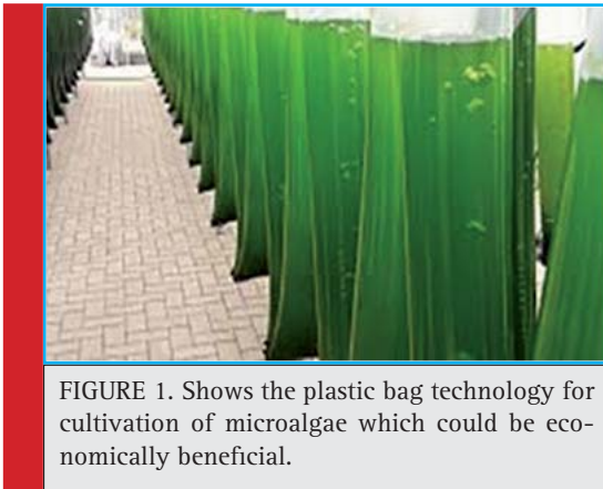
FIGURE 1. Shows the plastic bag technology for cultivation of microalgae which could be economically beneficial.

more beneficial in terms of daily productivity (Rao et al 2014; Arto et al 2016 and Soni et al 2016).